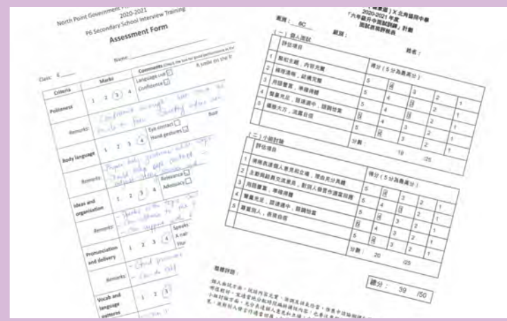
Teachers of Concordia Lutheran School - North Point gave feedback to students to let them understand how well they can handle the interview skills.

Teachers of North Point Government Primary School (Cloud View Road) conducted a "Workshop on Interview Skill" for their students before the mock interview