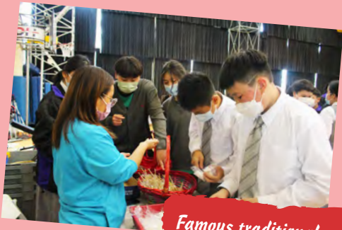
Famous traditional snacks

This year's Chinese History and Cultural Week was a great fun! Not only did it deepen our students' understanding of Chinese traditional culture, but it also aroused their interest in it.