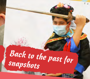
Back to the past for snapshots