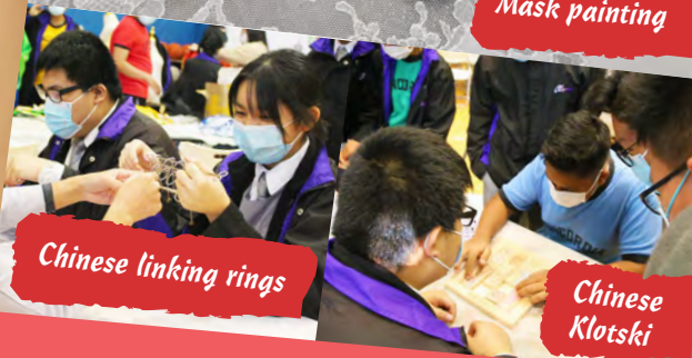
Chinese linking rings