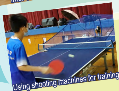
Using shooting machines for training