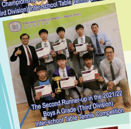
The Second Runner-up in the 2021/22 Boys A Grade (Third Division) Inter-school Table Tennis Competition