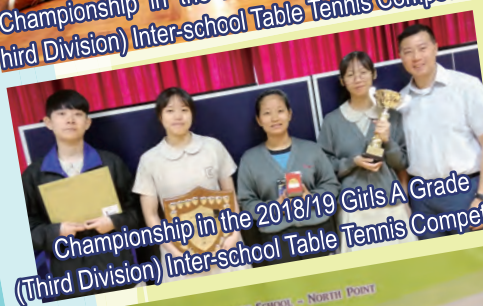
Championship in the 2018/19 Girls A Grade (Third Division) Inter-school Table Tennis Competition