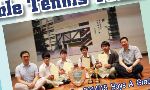
Championship in the 2014/15 Boys A Grade (Third Division) Inter-school Table Tennis Competition

It is hoped that Concordia's Table Tennis Team will continue to exert themselves, stay united and achieve more excellent results!