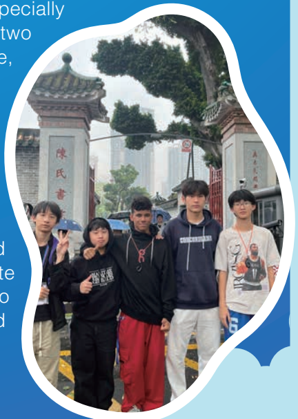
Chen Clan Ancestral Hall in the rain

To consolidate the learning outcomes, the school specially organized a post-trip sharing session and invited two students to attend. In a relaxed and joyful atmosphere, teachers and students enjoyed a rich buffet together and shared their insights and highlights of the journey. Chun Hiu Sing from Class 4A shared that this trip not only taught him a wealth of practical survival knowledge, but the excellent environment of the aerospace base hotel also completed the final puzzle piece of a perfect study tour, allowing him to truly experience what it feels like to be a pilot. Glauber from Class 5C mentioned that this Guangzhou trip was truly meaningful. The various innovative and interactive experiences were not only full of fun but also inspired their endless imagination for the future, making everyone deeply appreciate the importance of innovation and teamwork. On behalf of all students, he also extended the most sincere gratitude to the Principal, sponsors, teachers, and the entire behind-the-scenes team who made this trip possible.