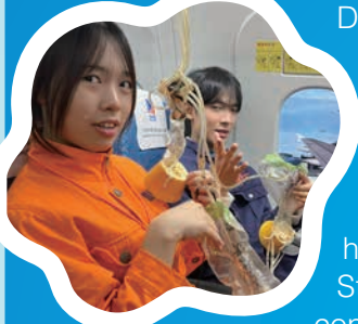
Students are learning about emergency escape knowledge

On the first day, students visited a training centre for professional aviation safety experiences. From basic theories to practical operations, the captain humorously shared interesting flying stories and the selection criteria for pilots. Students learned a wealth of emergency escape knowledge, such as the safety considerations behind straightening seats, stowing tray tables, and opening window blinds before takeoff. Furthermore, students personally entered a 1:1 simulated passenger cabin and experienced the emergency escape slide. The itinerary also included nebula exploration, desktop flight simulation, and FTD flight experiences, which, combined with a Virtual Reality (VR) rocket launch experience, allowed students to immerse themselves in an astronaut's journey into outer space. This allowed them to experience the awe-inspiring advanced technology and further stimulated their strong curiosity in the aviation field.